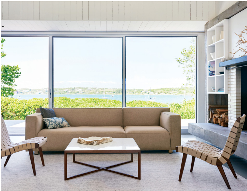
Barber Osgerby Two Seat Sofa (right) and Asymmetric Sofa (below)

cushions on each face. The signature, cast-aluminum leg can be specified in chrome and painted finishes, including Knoll's signature red color.