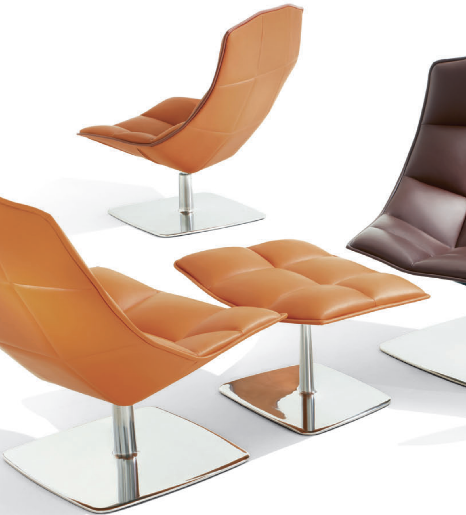
From right to left, Jehs+Laub Lounge Chair and Ottoman with articulating back and Polished Aluminum pedestal base, in Spinneybeck, Copenhagen, Tivoli Garden; Lounge Chair in Tivoli Garden with Sabrina, Henna contrasting leather welt; Lounge Chair in Sabrina, Henna; Lounge Chair and Ottoman with Prima, Vivaldi with Sabrina, Henna, contrasting leather welt.