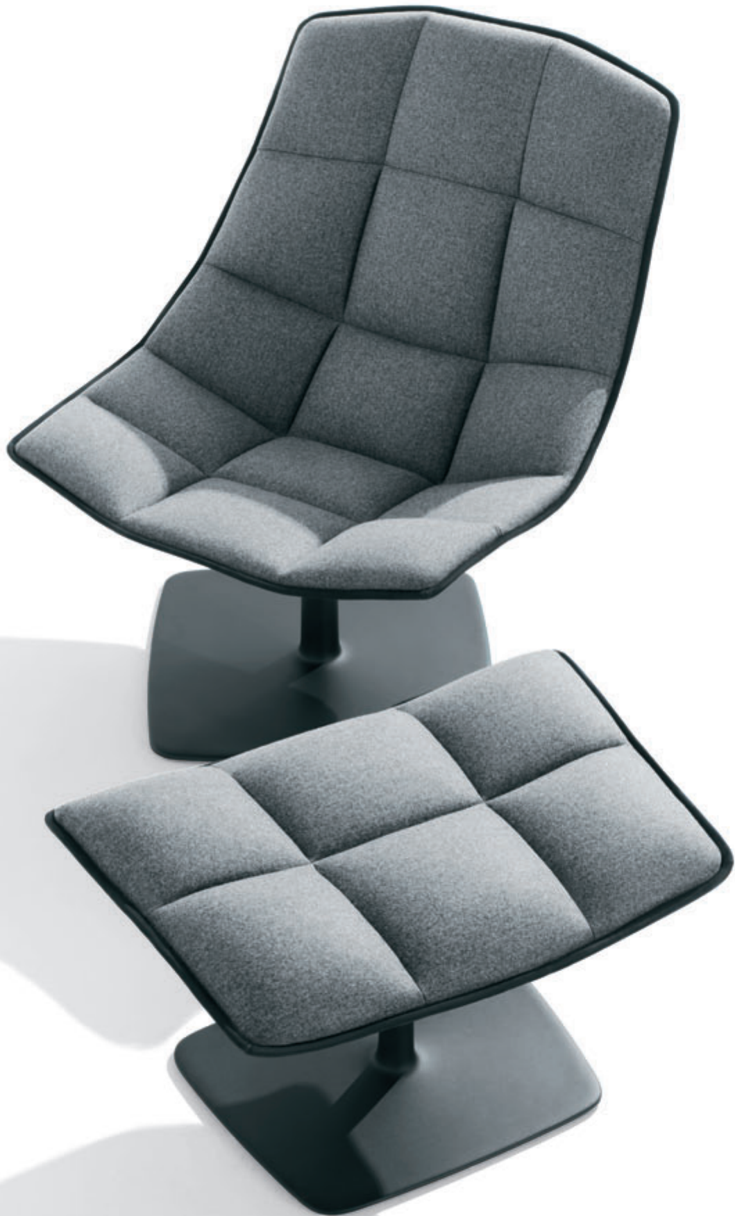
Jehs+Laub Lounge Chair with articulating back and Textured Black pedestal base, above, in Knoll Luxe® Stirling, Cobble with Spinneybeck, Volo, Black, contrasting leather welt.